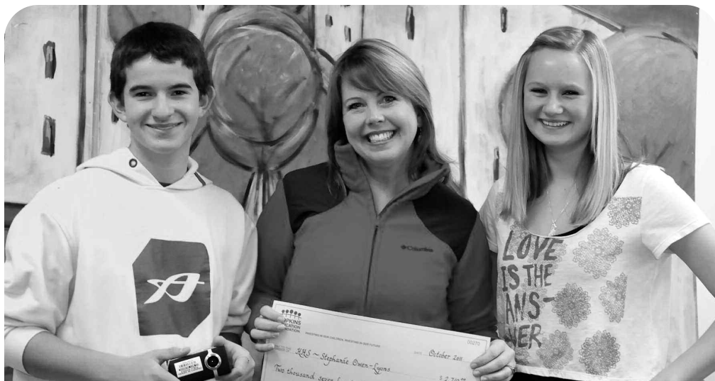
Roll 'Em Video Cameras for Language Assessments