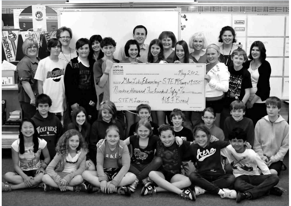
Science, Technology, Engineering and Math Grant